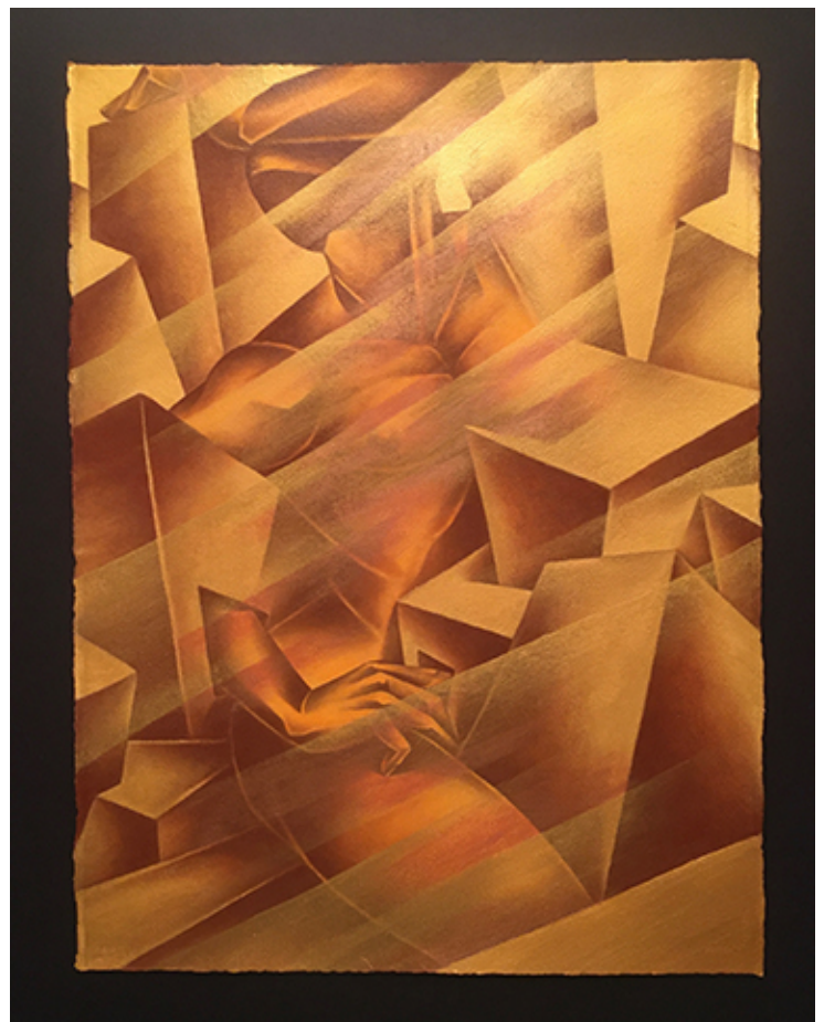
"URBAN METAMORPHOSIS"