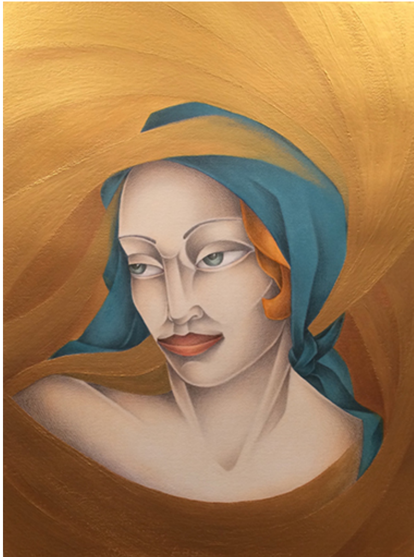
"MYKONOS' MADONNA" ©2020 by Noel Suarez

NS: Imagine taking figurative classical art, realism, surrealism, cubism, modernism, movement, the theatre and my Cuban heritage and putting them all in a food processor. With that said the best way to make people identify with my style of work is, Figurative Cubism.